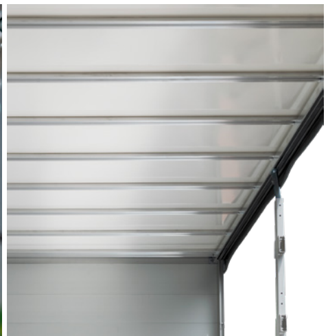
Laminate roof with aluminium omega profiles.