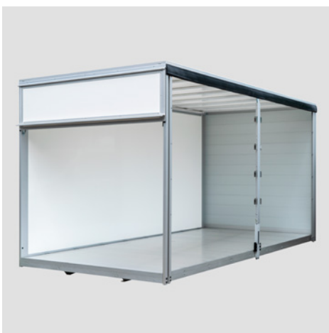
Special type of CS5 kit - PER panel on one side on the other side is ready for sliding tarpaulin.