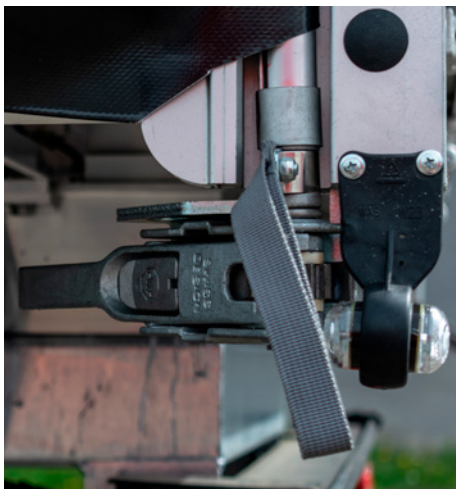
Tarpaulin tensioner with tube and adapter.