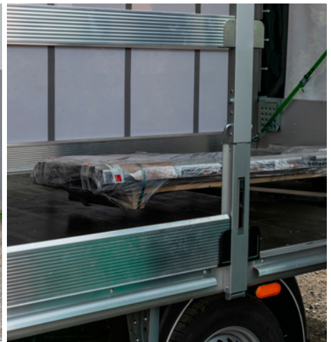
Detail of tarpaulin and pyramid planks with holders on the side pillar.