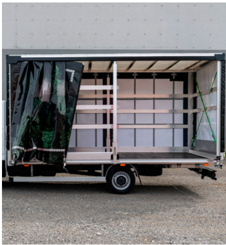
Detail of open sliding tarpaulin.