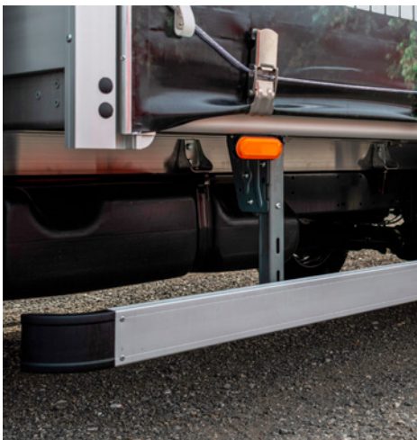
Detail of accessories for CS5 kit. (side lamp and side protection)