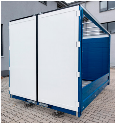
Rear aluminium painted doors, RAL 9010.