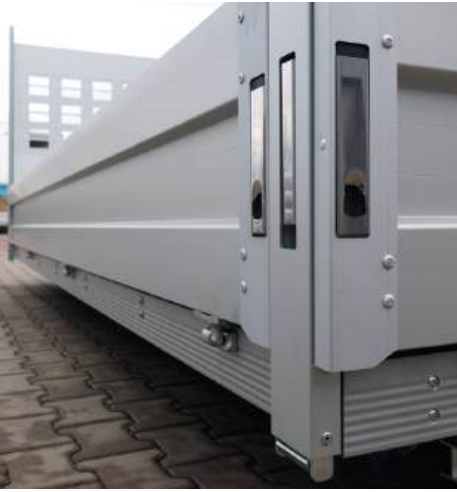
Detail of aluminium pillar connection with standard locks.