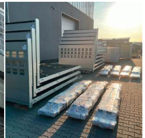
Packaging of kits for shipping to the customer.