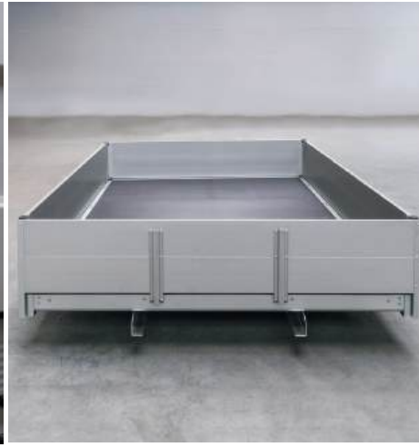
The front wall 400 mm with the Omega reinforcement.