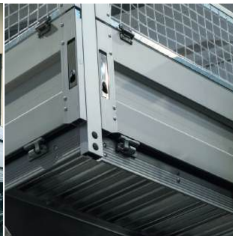
Detail of aluminium floor and steel extensions over the sidewalls.