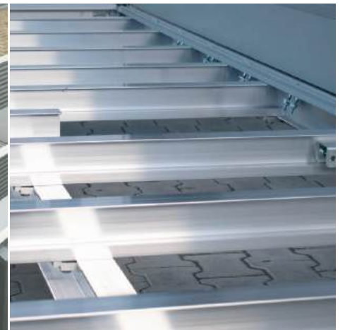
Aluminium frame 130/70 mm.