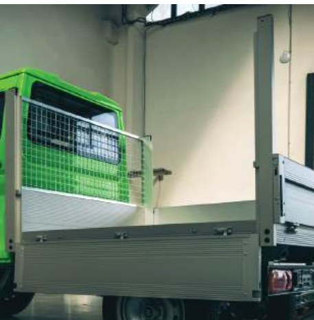
Open body with 300 mm sidewalls with fixed extended pillars.