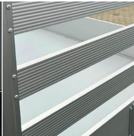
Detail of the tarpaulin planks on the front wall.