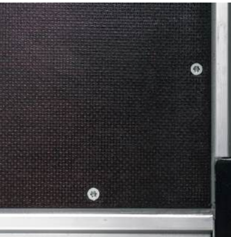
Detail of the plywood floor.